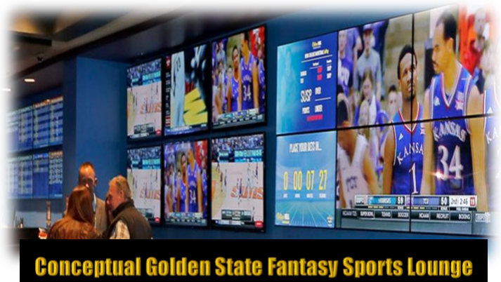
Conceptual Golden State Fantasy Sports Lounge