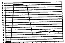
Example: Santa Barbara

As the economic model line charts illustrate, the Fund will reach a state of equilibrium after deferred depreciation and the F&E refundable loans have been paid down. After this equilibrium has been reached, our model projects that Fund assessments will remain stable into the foreseeable future.